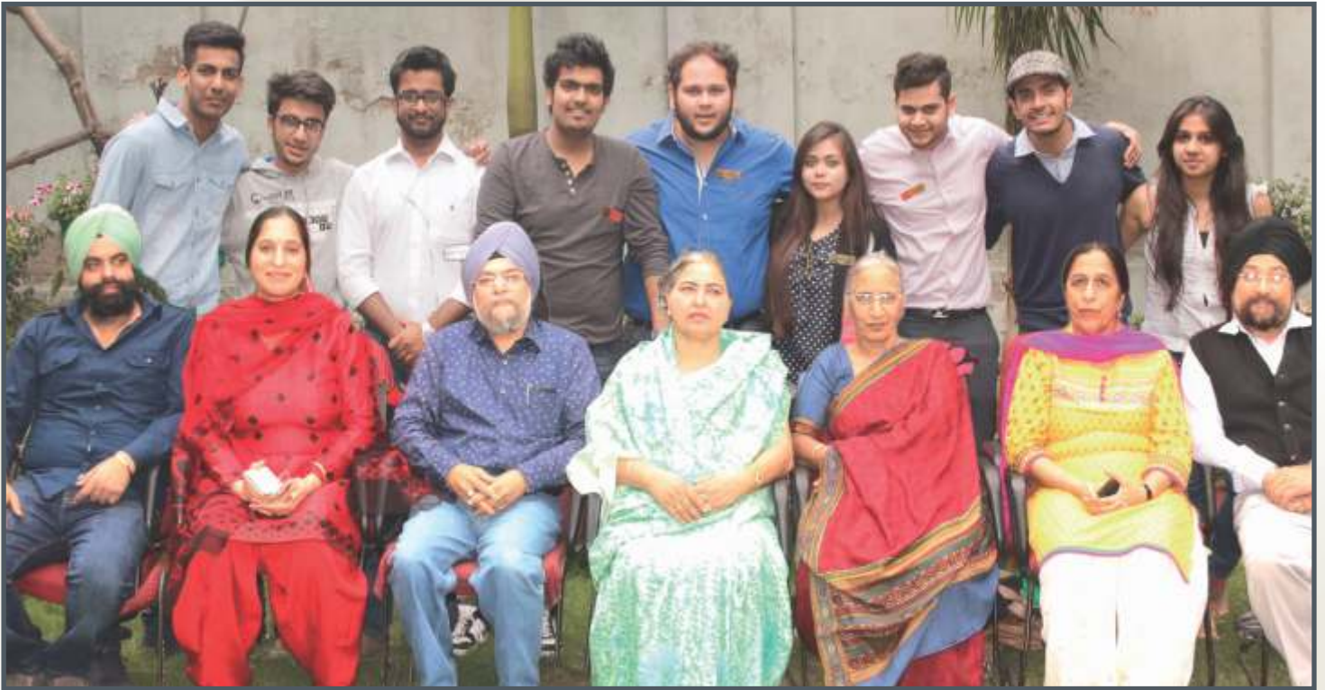
Placement Cell Team