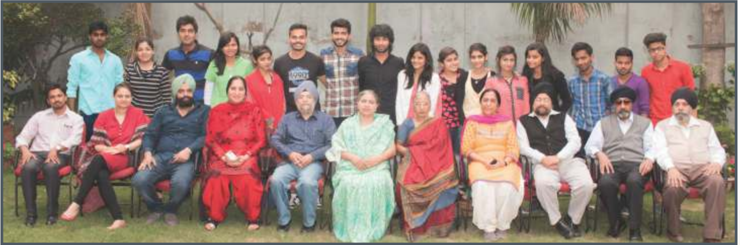
Magus Dance Society