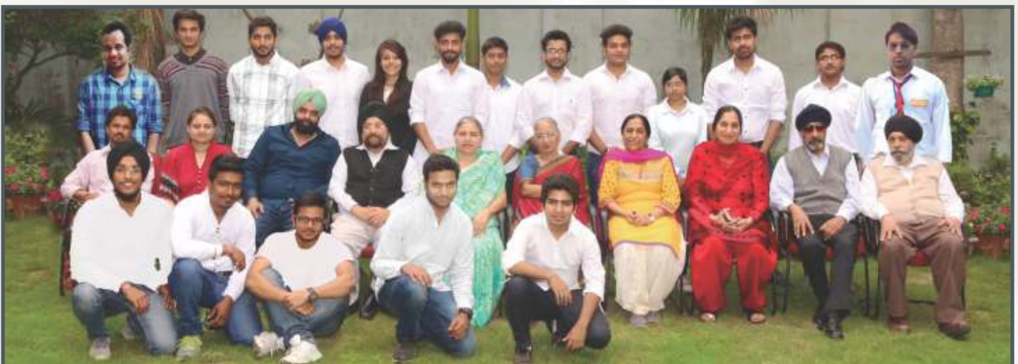
Photobug - The Photography Society