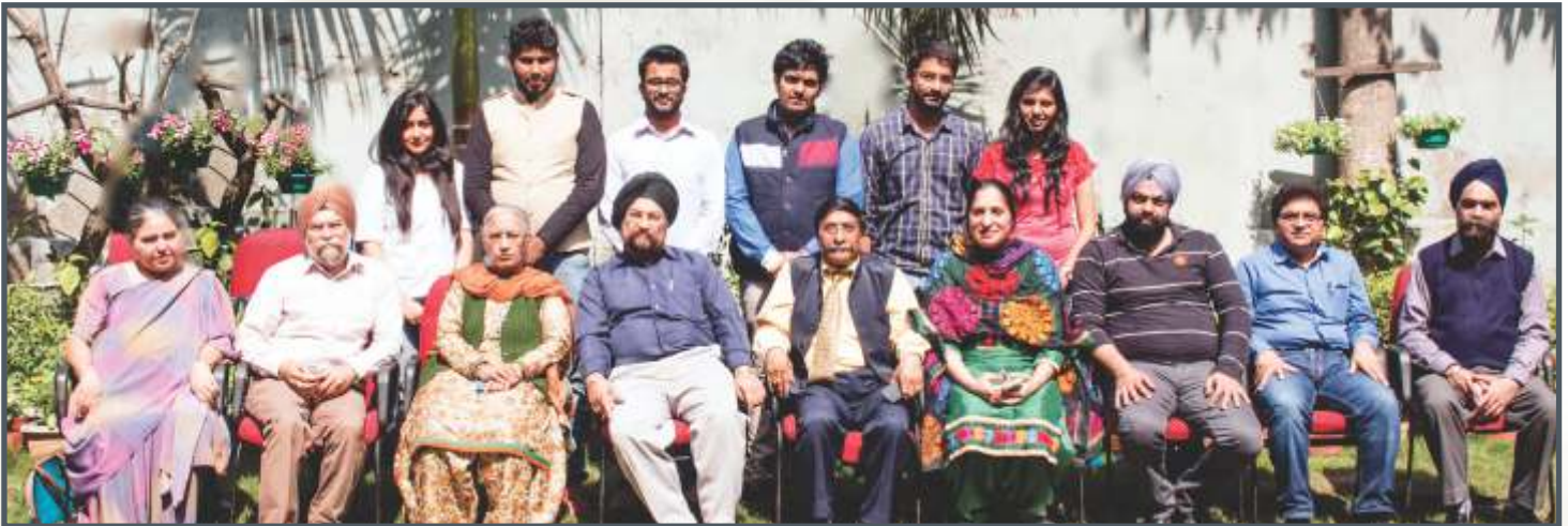
Vanaj Core Team