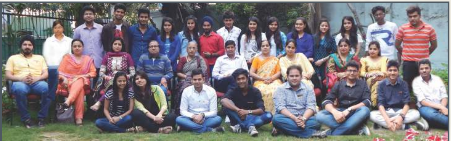
Kirt Eco Society