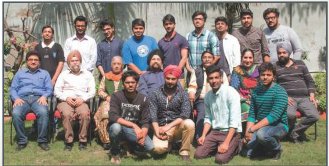
Cyber Clan Group