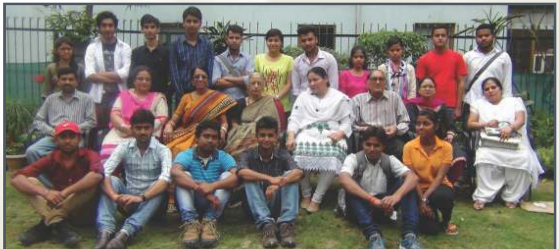
Hindi Sahit Sabha