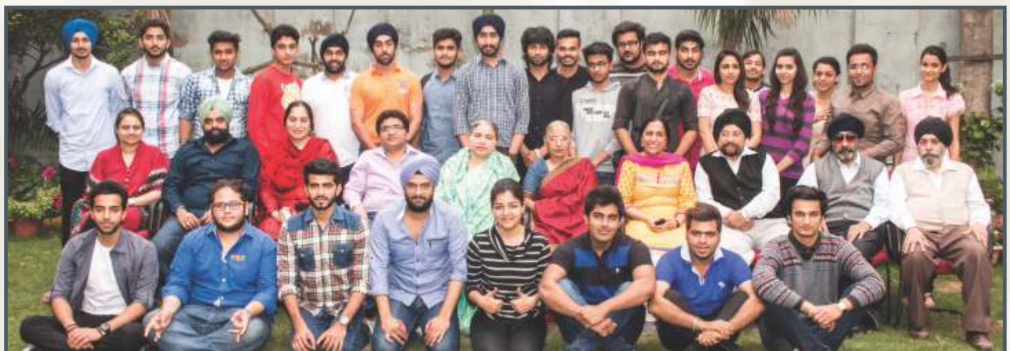
Art & Culture Group