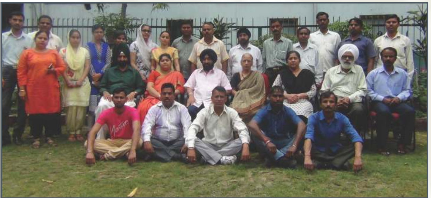
Non Teaching Staff