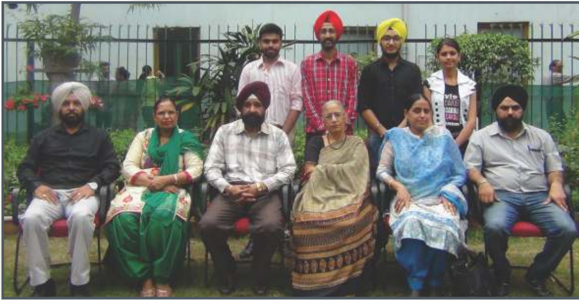
Punjabi Sahit Sabha