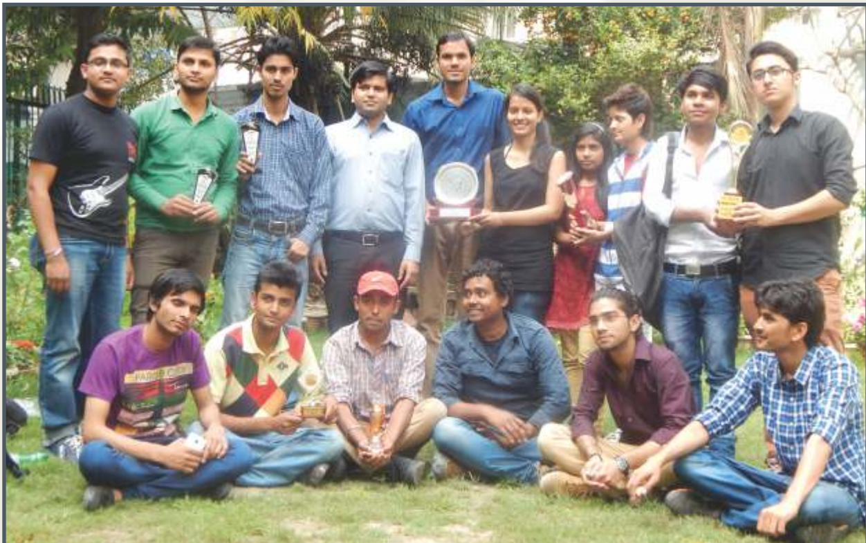
Students with Prizes and Trophies won in various competitions