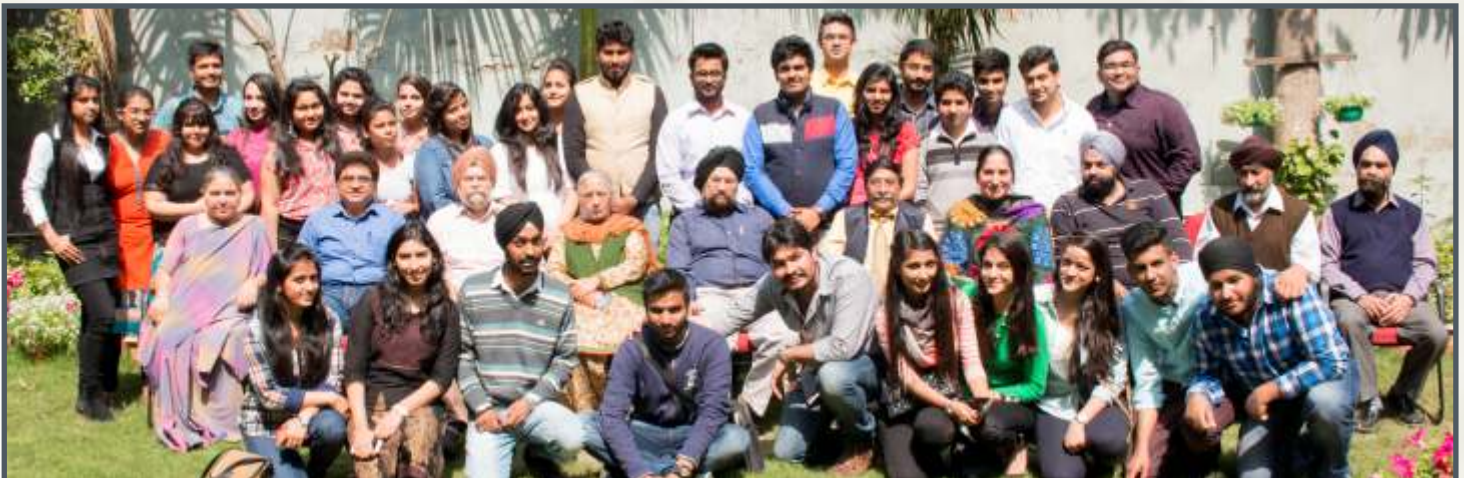
Vanaj Commerce Society Group