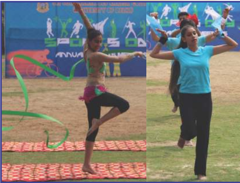
Students performing on the occasion