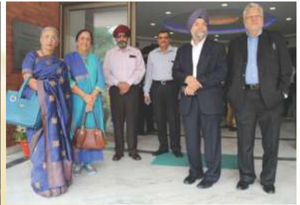
Prepared for the Seminar