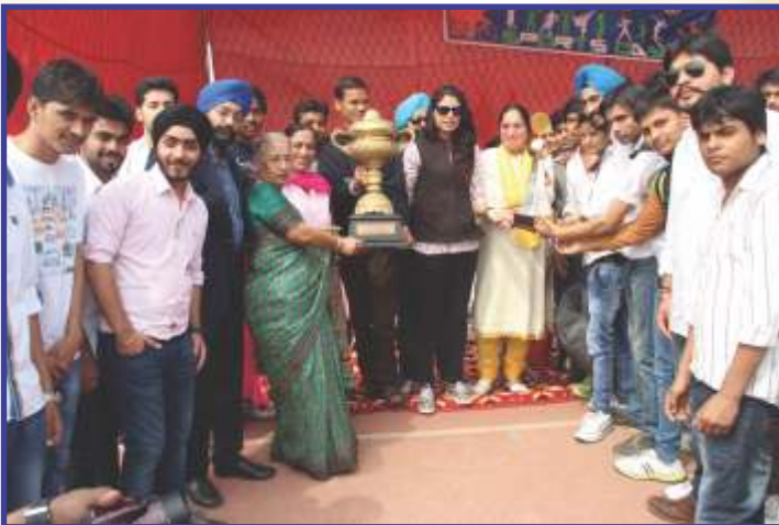
Chief Guest and Principal handing over the trophy