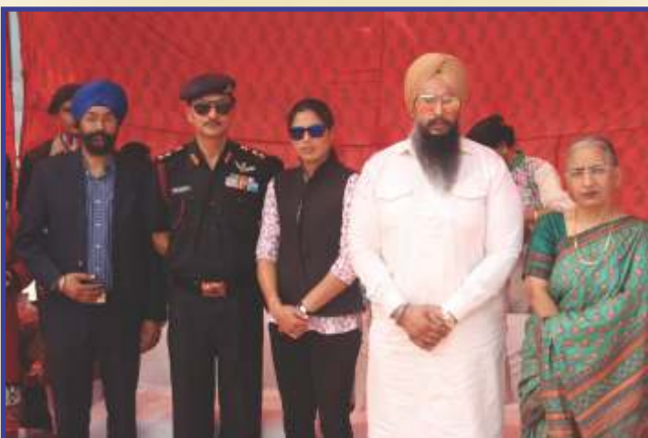
Guests with Principal & Bursar