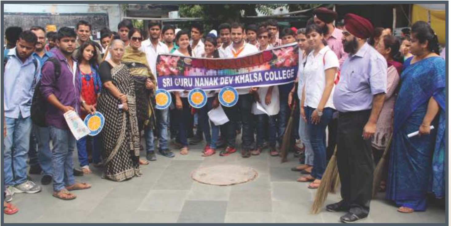
Principal along with Teachers and Students of the College during Swachh Bharat Abhiyan