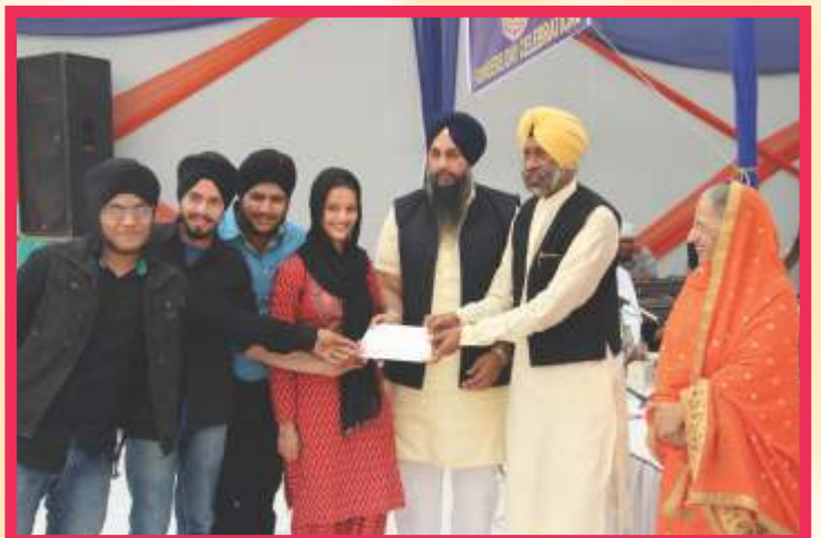
Chief Guests along with Principal distributing the certificates to the Students