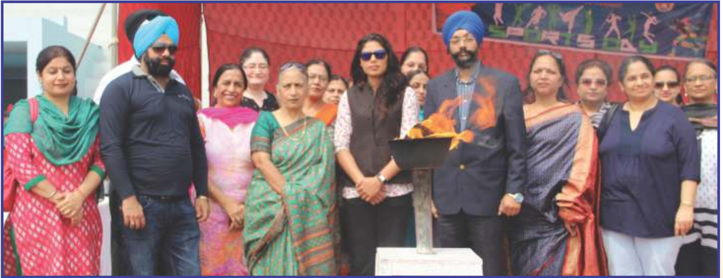
Chief Guest Ms. Vice Captain Indian Women's Cricket Team along with Principal and teachers lighting the Games Torch