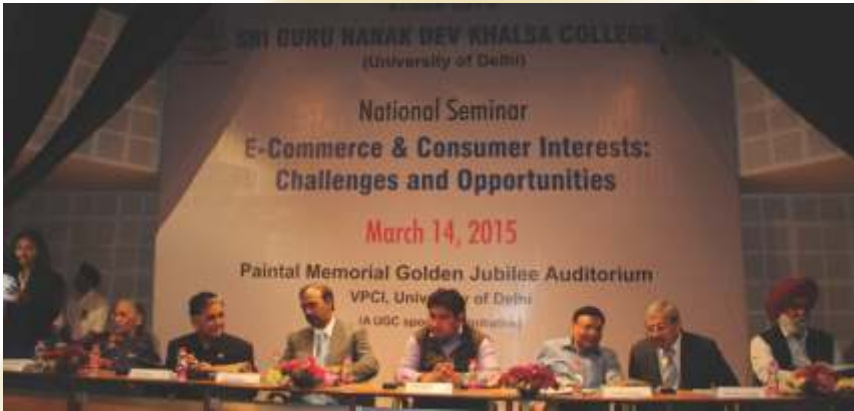
Discussion Panel at the Seminar