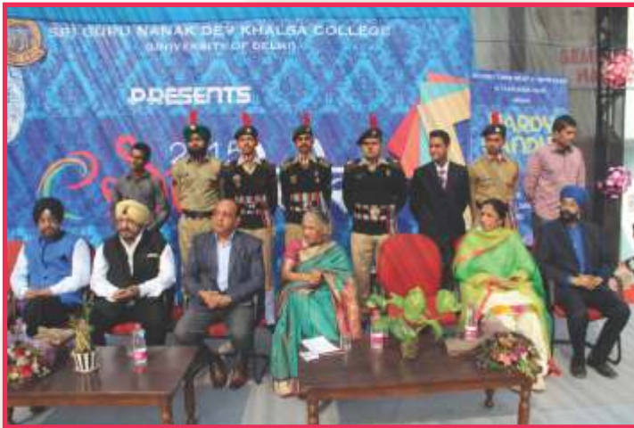
Eminent Guests with Principal