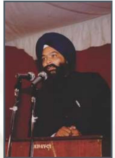
S. Prem Singh Chandumajra (MP)