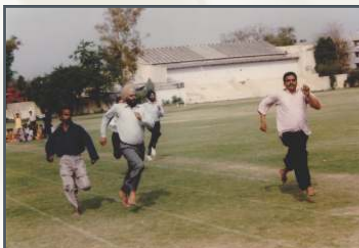
Non Teaching Staff participating in 100 Meter Race