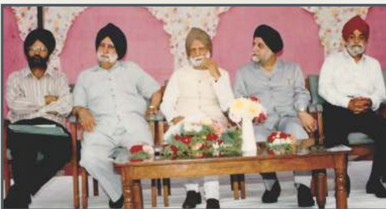
Guests enjoying the fest