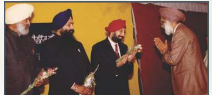
Principal facilitating the Guests