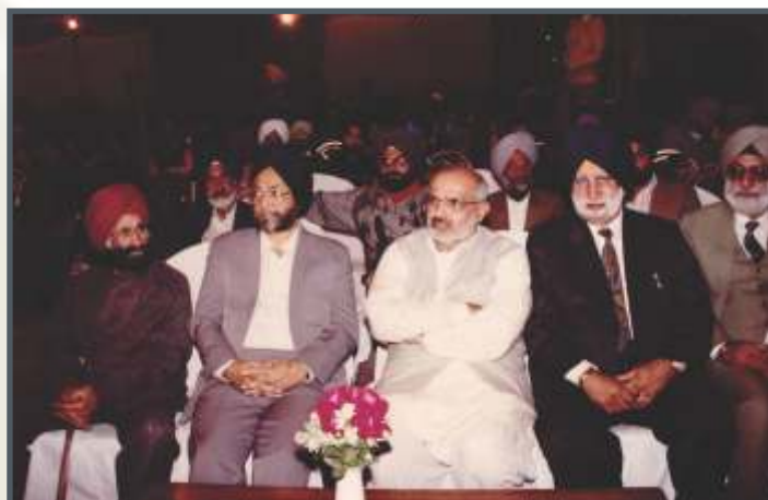
Prof. Sahib Singh Verma (Former CM Delhi) with Other Guests