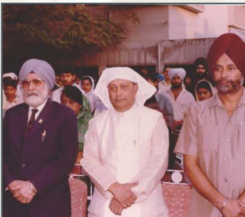
Eminent Guests at the Occasion