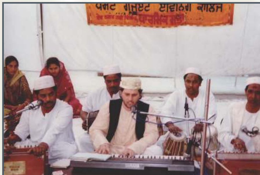
Artists performing on the occasion